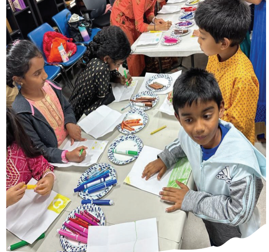
Scenes from Sunday Dharma Class