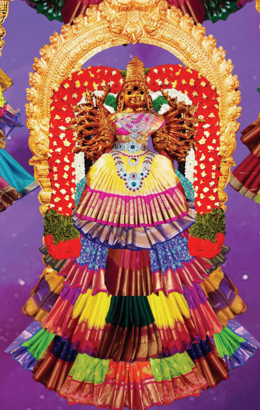
Sri Chandika Parameswari