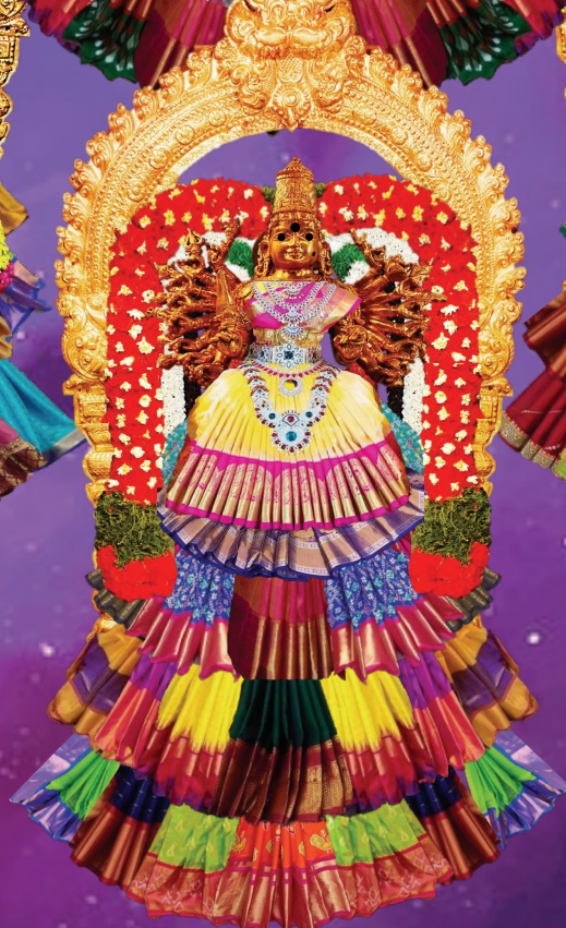
Sri Chandika Parameswari