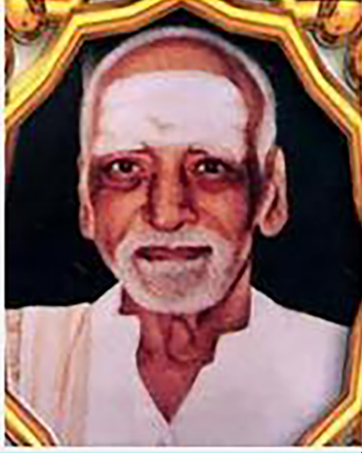
Papanasam Sivan (09/26 1890 -10/01 1973)

Special Inclusion - Krithis of Arunachala Kavi